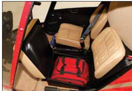
Under-seat storage compartment

STORAGE under each seat allows for carry-on bags, briefcases, and personal belongings.