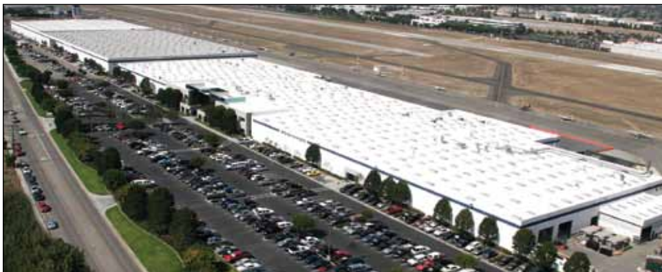
Robinson's 617,000 square foot facility.

Robinson manufactures, assembles, inspects, and flight tests all of its helicopters at its Torrance, California factory. State-of-the-art equipment is utilized to manufacture the majority of parts in-house, allowing Robinson to maintain a high level of quality control and eliminate unnecessary costs.